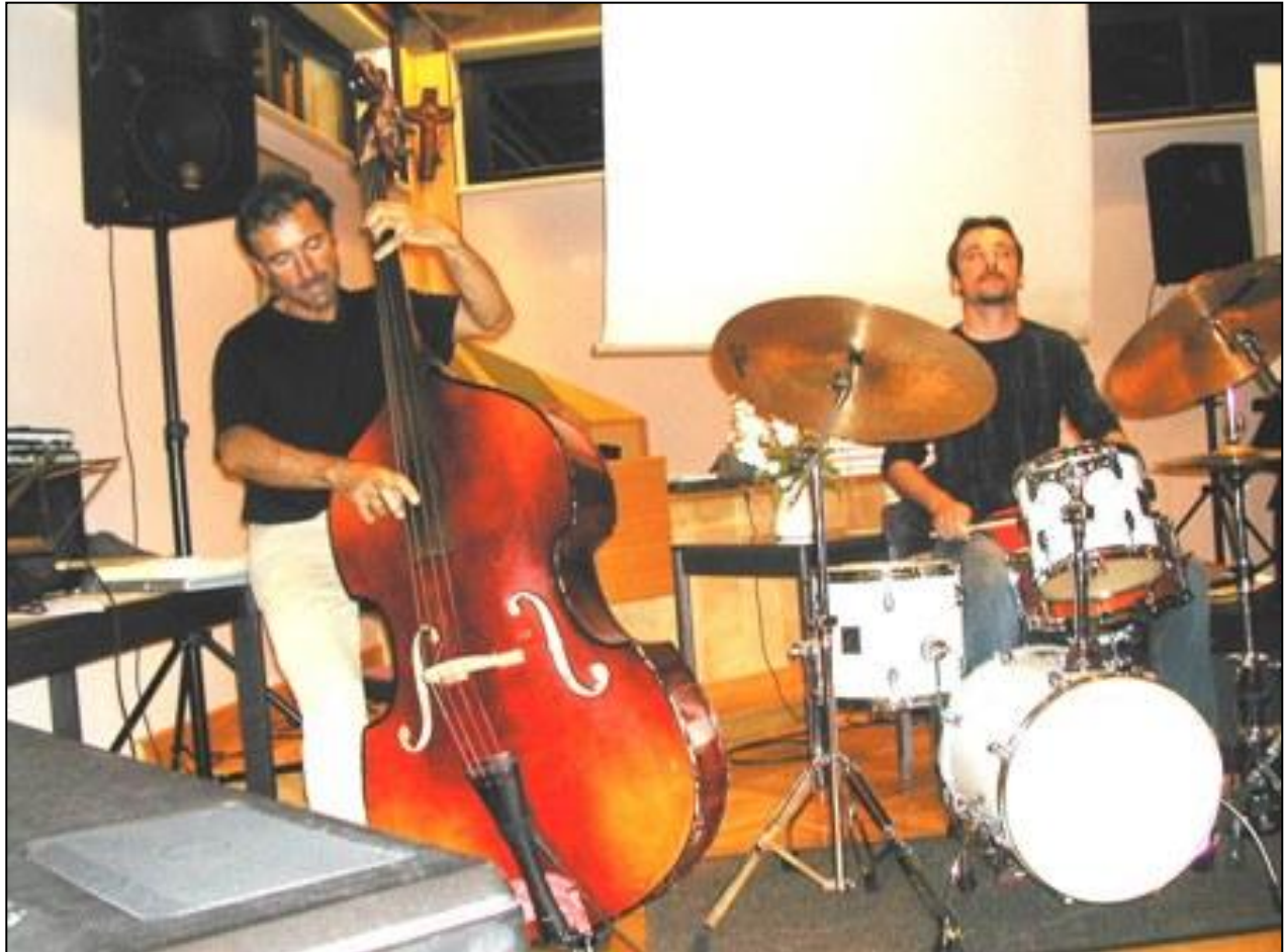
Jazz Concert at Conference 2006

The intensive work was balanced by a Jazz concert one evening, and the traditional 'Evening of the Nations', which included intercessory prayer as well as an impromptu European fashion show, showing above all the humorous creativity of the participants.