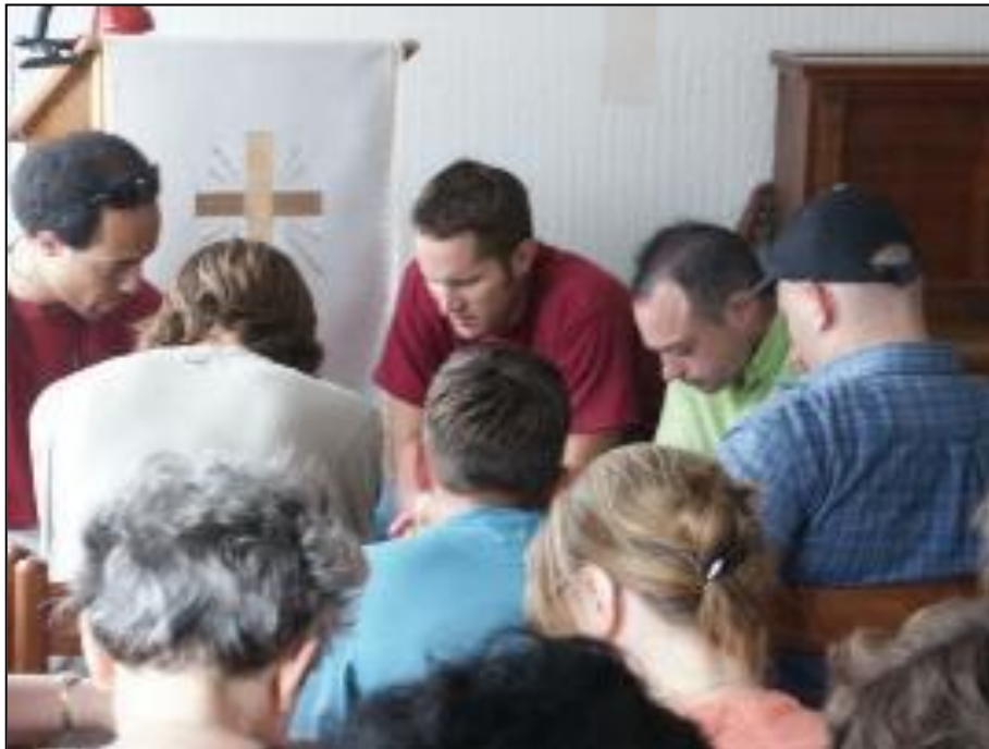
Some conference participants praying together in a Vučovar church

The 2003 general conference was held in the Evangelical Theological Faculty in Osijek in northeastern Croatia.