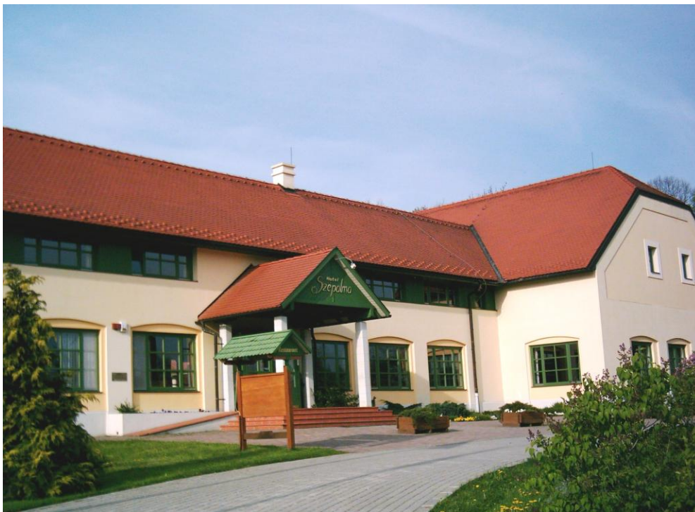
Hotel Szépalma, Zirc, Hungary, the venue of the 2004 Conference

presented three lectures on the conference theme. Six context-based groups worked both as separate groups and together in plenary discussions to identify both what they share with Christians working in other educational contexts and what is distinctive to their own contexts.