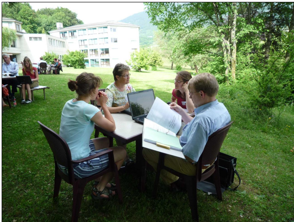
Working hard in a soft environment: 2009 at the Institute Emmaus in Vevey

The founders of EurECA hope and pray that the movement will take hold within the next generation of believers in European countries and indeed spread to countries of the Middle-East, Asia and ultimately extend globally to fulfill the Great Commission "to make disciples of all nations, teaching the new disciples to obey all the commands given by our Lord."